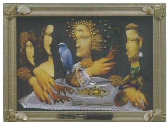
Mona Lisa collages by Parajanov