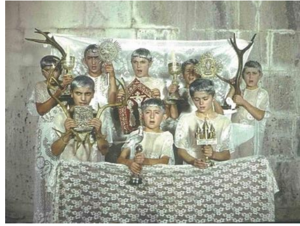
Stills from the film The Colour of Pomegranate with lithe, unearthly Georgian actress Sofiko (Sophia) Chiaureli notably in six male and female roles. The ethereal Sophiko passed away in 2008, age 70, in Tbilisi .